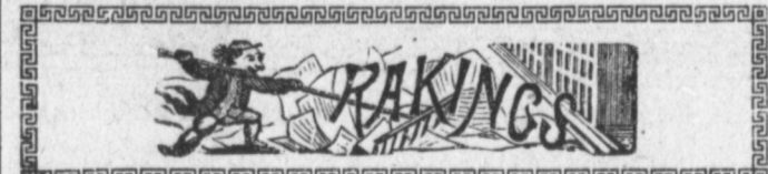
THAT LAW AGAIN.

RECENT statistics show that the total bonded indebtedness of the 25 larger cities of the country outside of New York is about $417,000,000—almost one hundred millions less than that of the metropolis.